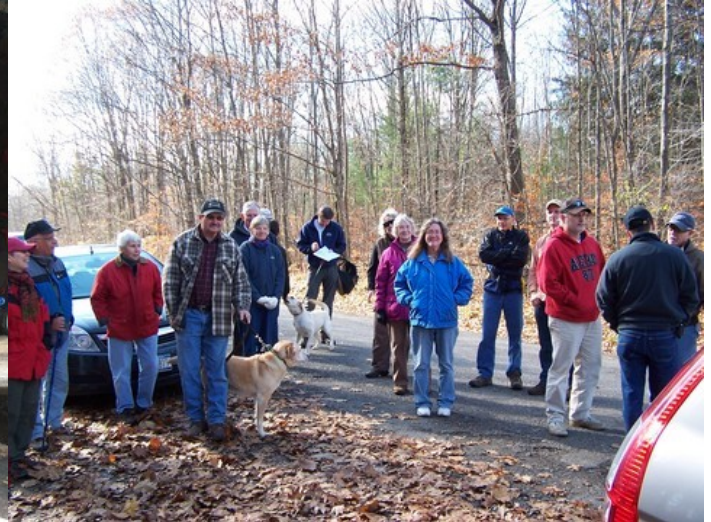
The 'group' of 18 plus two canines head to the Oakley Corners Slave graveyard!